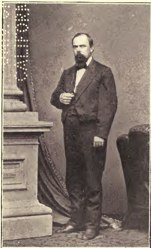
HON. OLIVER P. MORTON. (1866.) Governor of Indiana.